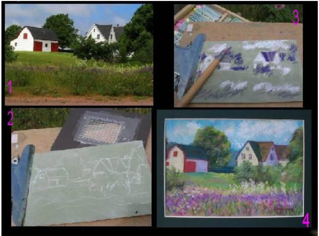
Photo 3. I underpaint the darks and lights and push them into the tooth with a wipe-out tool (or you could use a color-shaper or a white eraser that come in clickable pen form-like a mechanical pencil.)

Photo 2. 5x7 soft green mattboard covered with clear Golden Pastel Ground. I'm not comfortable with buildings, and want to practice painting them.