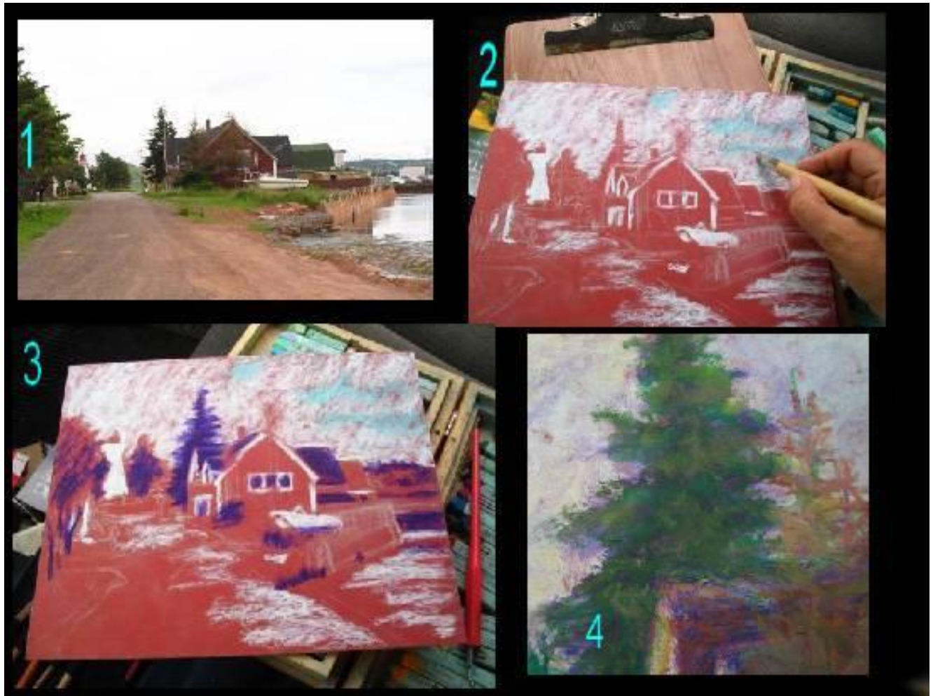
Photo 3. Darks are underpainted with violet.

Photo 2. Sketched with a white charcoal pencil on 8x10 matboard with clear pumice ground. Since it is fairly dark, the lightest areas are underpainted with white., and blended into the tooth with a wipe-out tool.