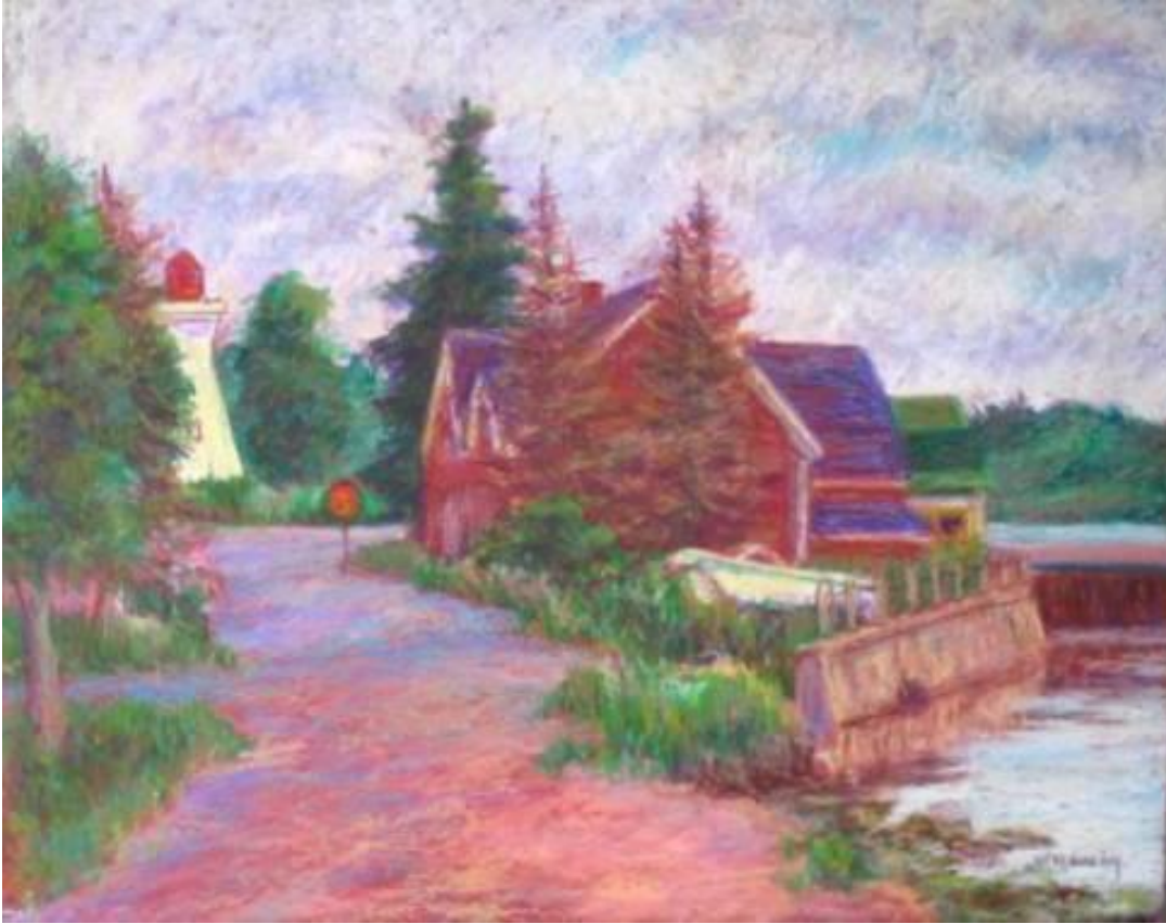
The finished painting, Victoria-By-The-Sea